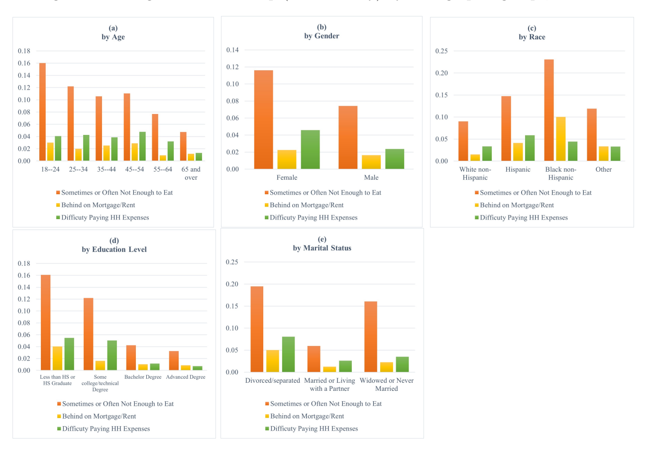
Figure 3: Average level of hardship (food security) by demographic groups, UCBES

Notes: Weighted mean levels of hardship by demographic groups, categories where demographic characteristic not reported omitted. UCBES data.