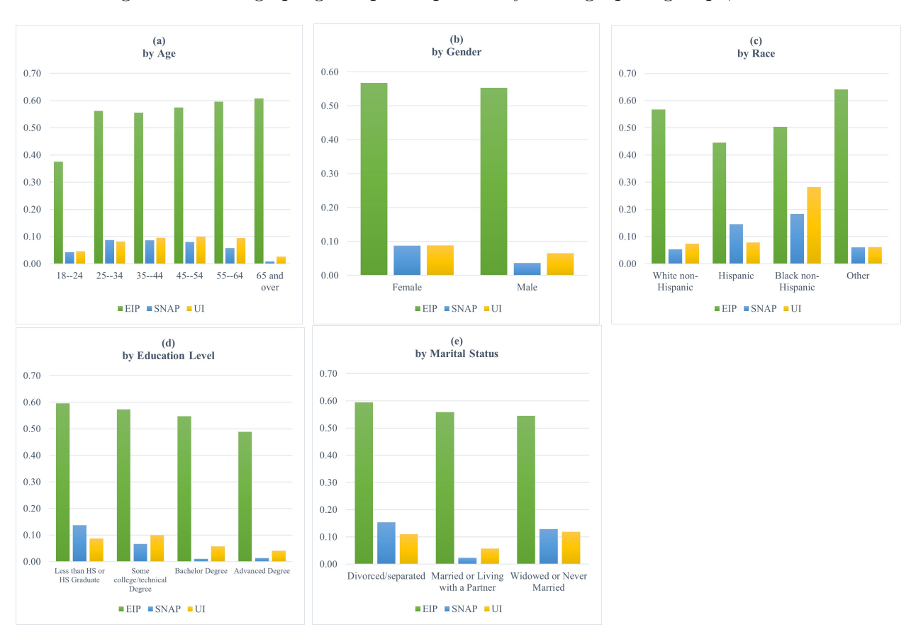
Figure 1: Average program participation by demographic groups, UCBES

Notes: Weighted mean participation in programs by demographic groups, categories where demographic characteristic not reported omitted. UCBES data.